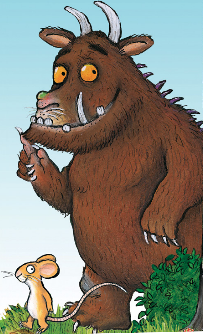
The Gruffalo © Julia Donaldson and Axel Scheffler 1999 - Macmillan Children's Books