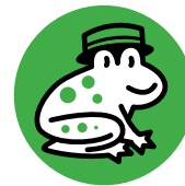
A Year with Frog and Toad